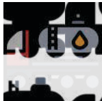
Bulk Fuel Transportation